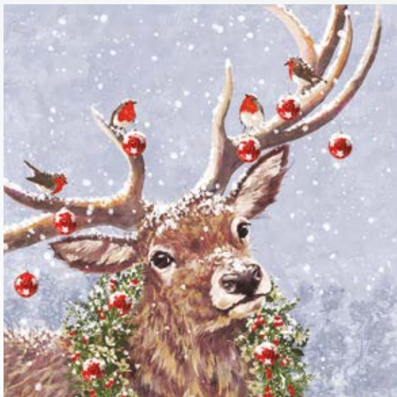
Festive Stag & Robins Size: 140 mm x 140 mm Sending warm wishes for Christmas and the New Year 10 cards & envelopes £4.25