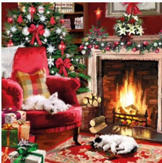
Fireside Snuggles Size: 126 mm x 126 mm Sending warm wishes for Christmas and the New Year 10 cards & envelopes £4.25