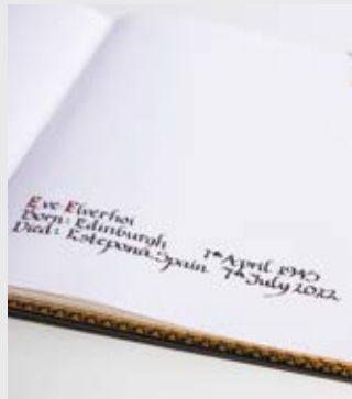
An entry in the BRACE Book of Remembrance

At BRACE, we offer a heartfelt tribute to those who have passed away from or with dementia through our Book of Remembrance. Each name is carefully inscribed by a skilled volunteer calligrapher, ensuring a personal and beautiful commemoration. It is completely free to have your loved one's details entered.