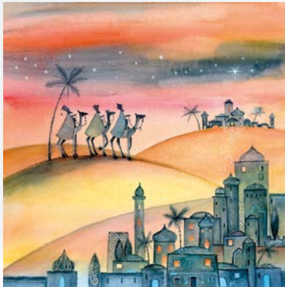
Bethlehem at Dusk

All cards are printed on FSC certificated board, by an FSC certificated printer. The cards are then packed with envelopes manufactured from FSC certificated paper.