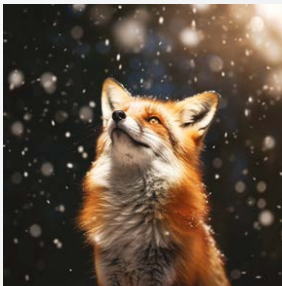
Midnight Fox Size: 126 mm x 126 mm Sending warm wishes for Christmas and the New Year 10 cards & envelopes £4.25

As well as using the order form enclosed, our 2024 cards are available from the following sources: