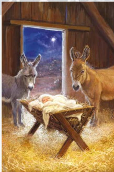
Baby Jesus in a Stable Size: 152 mm x 100 mm Wishing you hope, peace and love at Christmas time 10 cards & envelopes £4.25